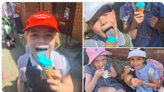
Using a map and compass to find Roman remains #SpiresGeography @SpiresFed

Just this week our KS2 children were exploring Lincoln as part of a Geography field trip – part of the day was also spent looking at Roman remains - and maybe the highlight for some was the visit to the ice cream shop!